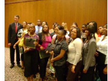
UB 2008 Graduates and Congressman Bob Etheridge