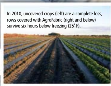
In 2010, uncovered crops (left) are a complete loss, rows covered with AgroFabric (right and below) survive six hours below freezing (25° F).